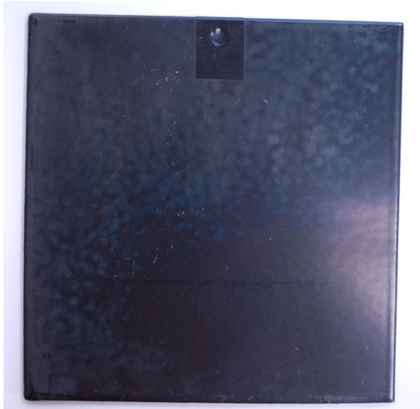
Sample 2B, 100 Cycles, Polyarmor G17