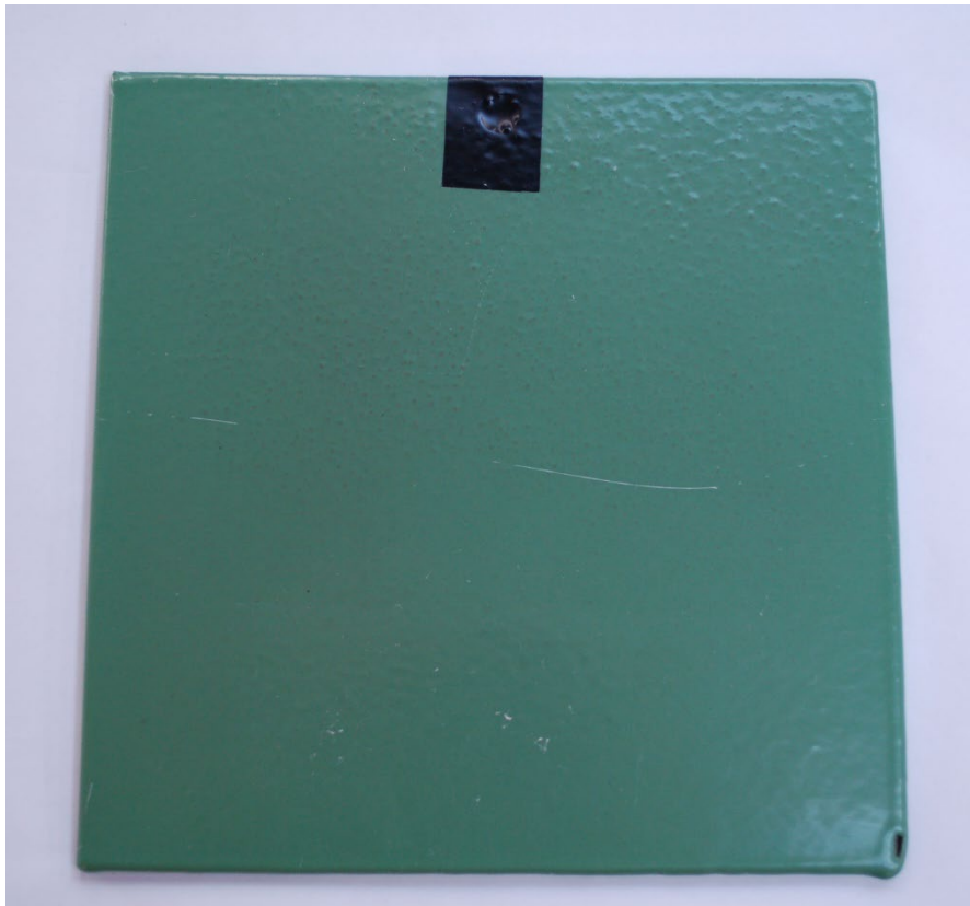
Sample 8B, 100 Cycles, Carbolite 858 & Pipe Clad 2000 Epoxy