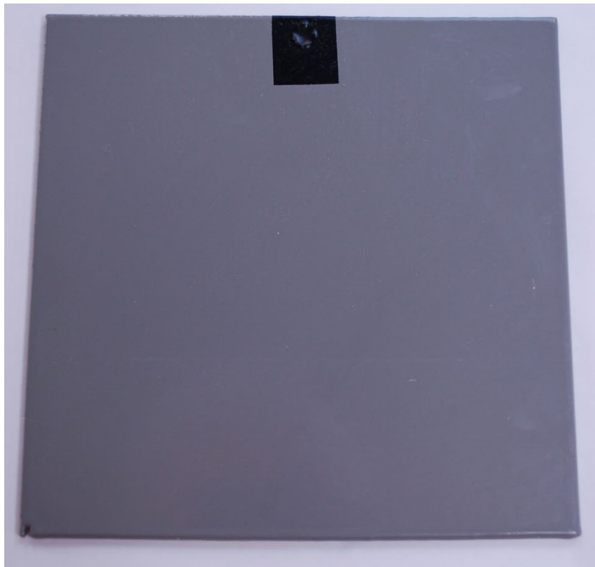
Sample 7B, 100 Cycles, Valspar EEG 70% Zinc & TCI RAL 7037 Polyester