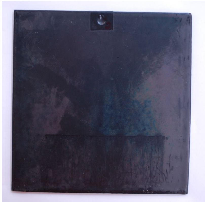
Sample 2A, 100 Cycles, Polyarmor G17