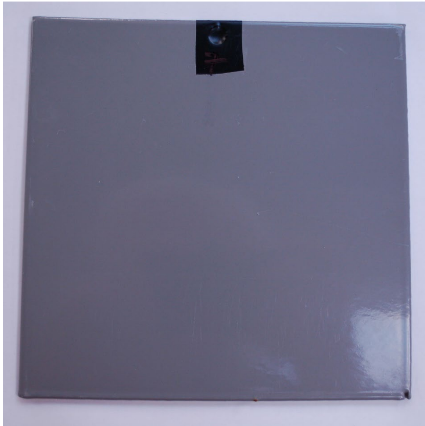
Sample 7A, 100 Cycles, Valspar EEG 70% Zinc & TCI RAL 7037 Polyester