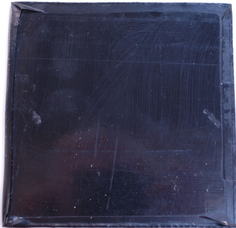
Sample 9B, 100 Cycles, Trenchcoat over galvanized