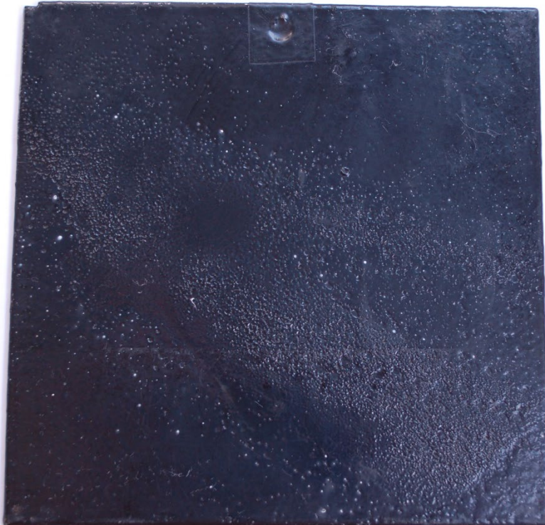
Sample 4B, 100 Cycles, Carboline 858 & Polyarmor G17