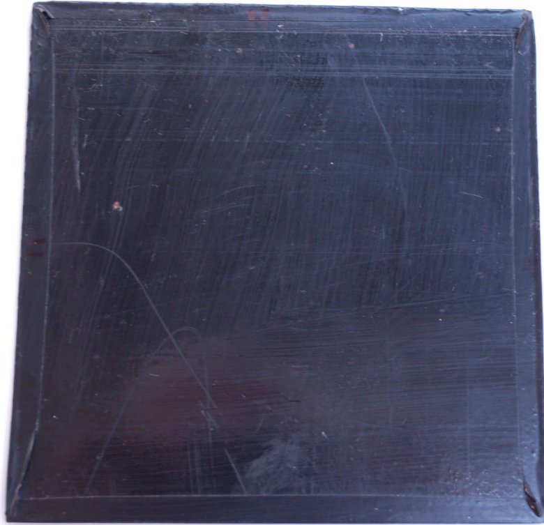
Sample 11A, 100 Cycles, Trenchcoat over galvanized