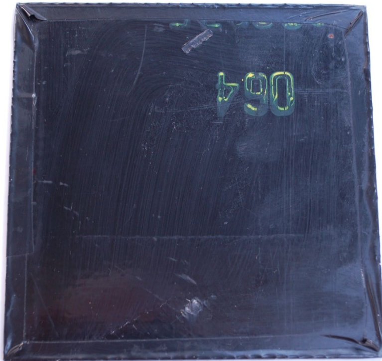
Sample 10B, 100 Cycles, Trenchcoat over galvanized