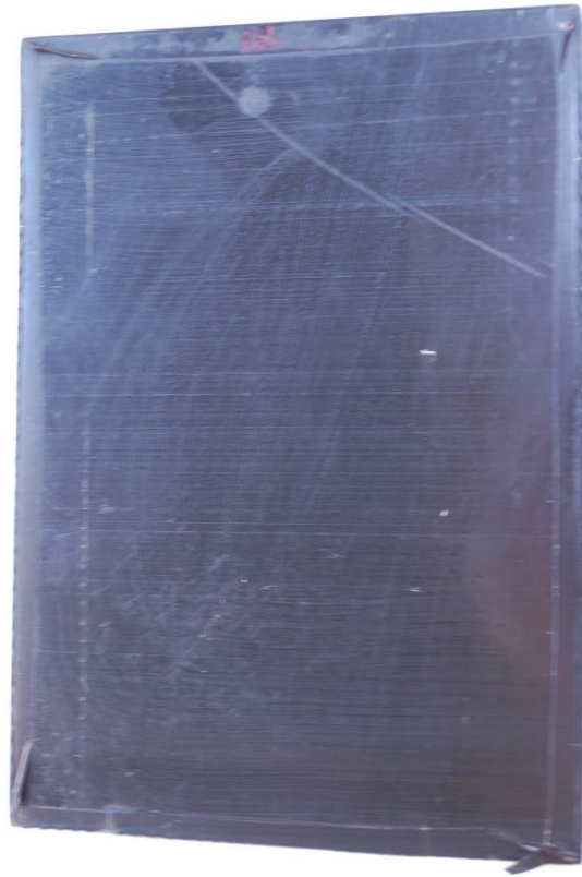
Sample 12A, 100 Cycles, Trenchcoat over galvanized