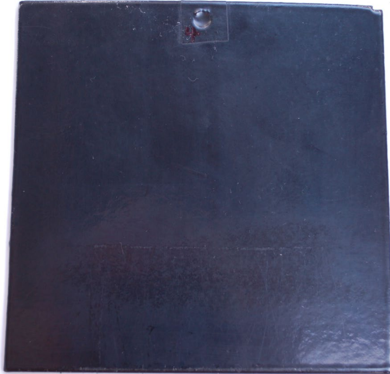
Sample 4A, 100 Cycles, Carboline 858 & Polyarmor G17