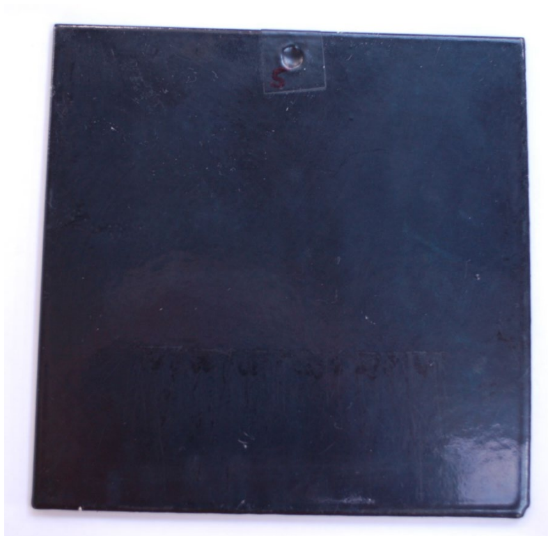
Sample 5A, 100 Cycles, Carboline 858 & Polyarmor G17