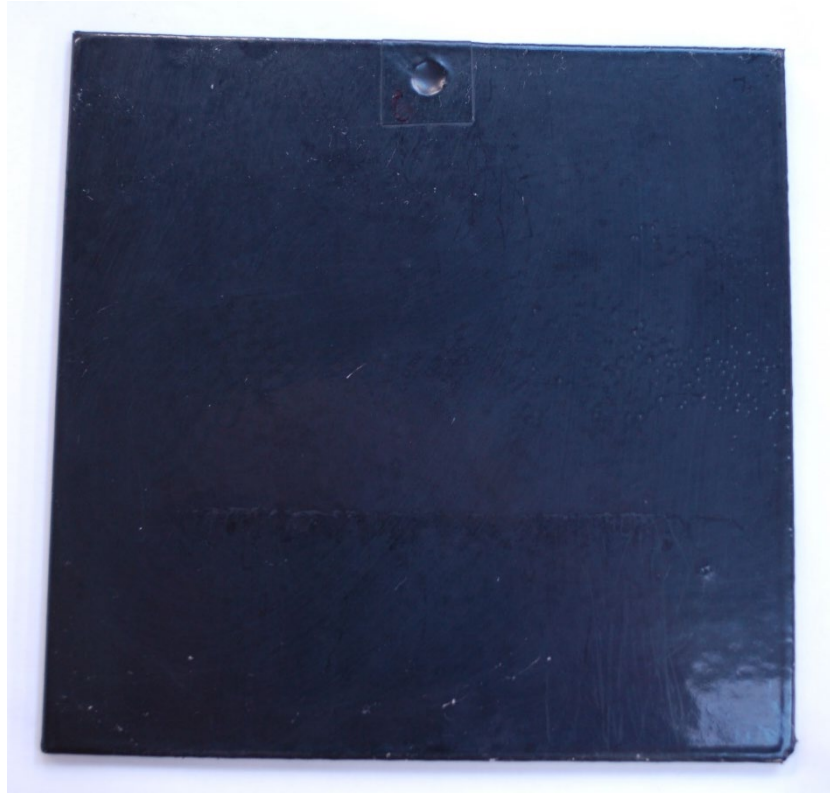
Sample 6A, 100 Cycles, Carboline 858 & Polyarmor G17