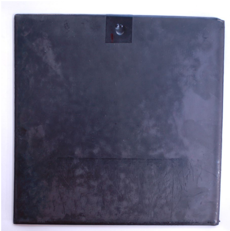
Sample 1A, 100 Cycles, Polyarmor G17