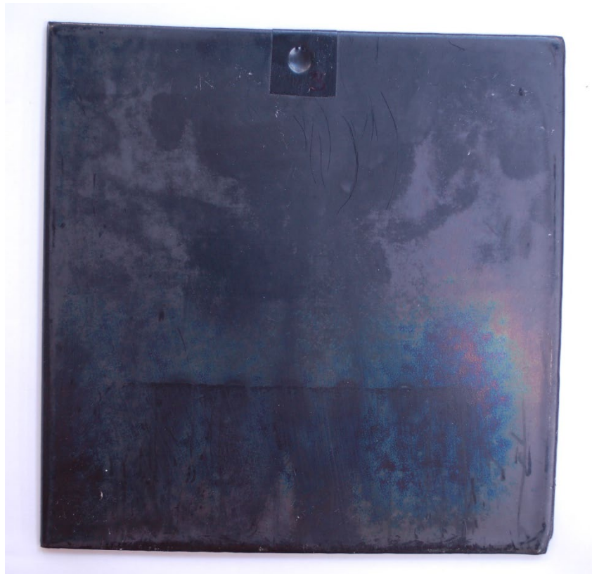
Sample 3A, 100 Cycles, Polyarmor G17