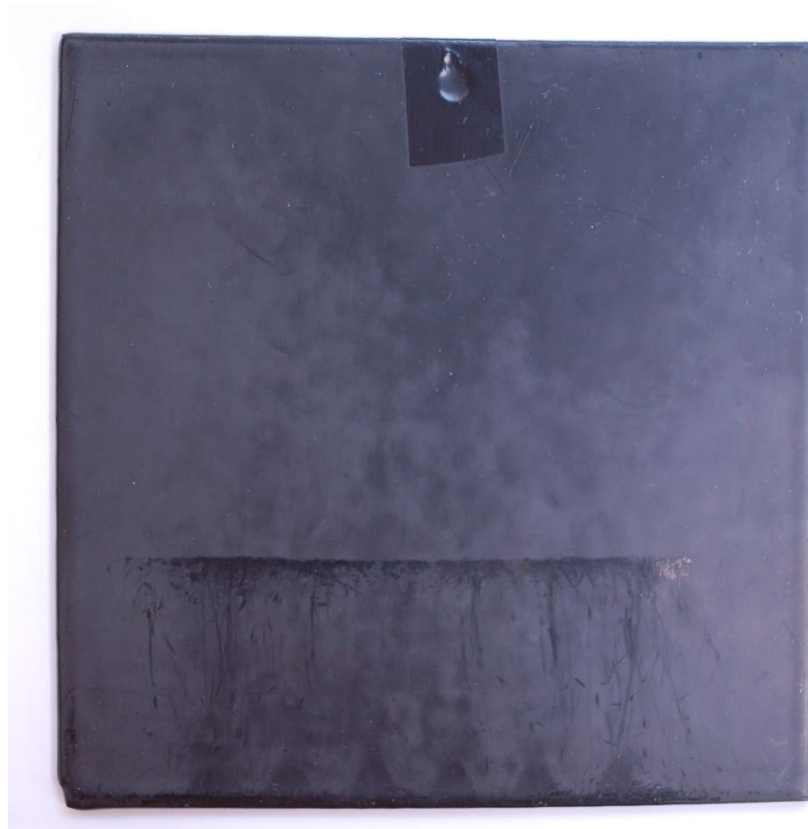
Sample 3B, 100 Cycles, Polyarmor G17