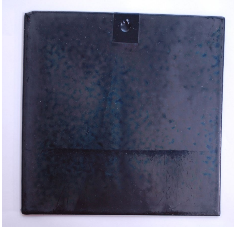
Sample 1B, 100 Cycles, Polyarmor G17