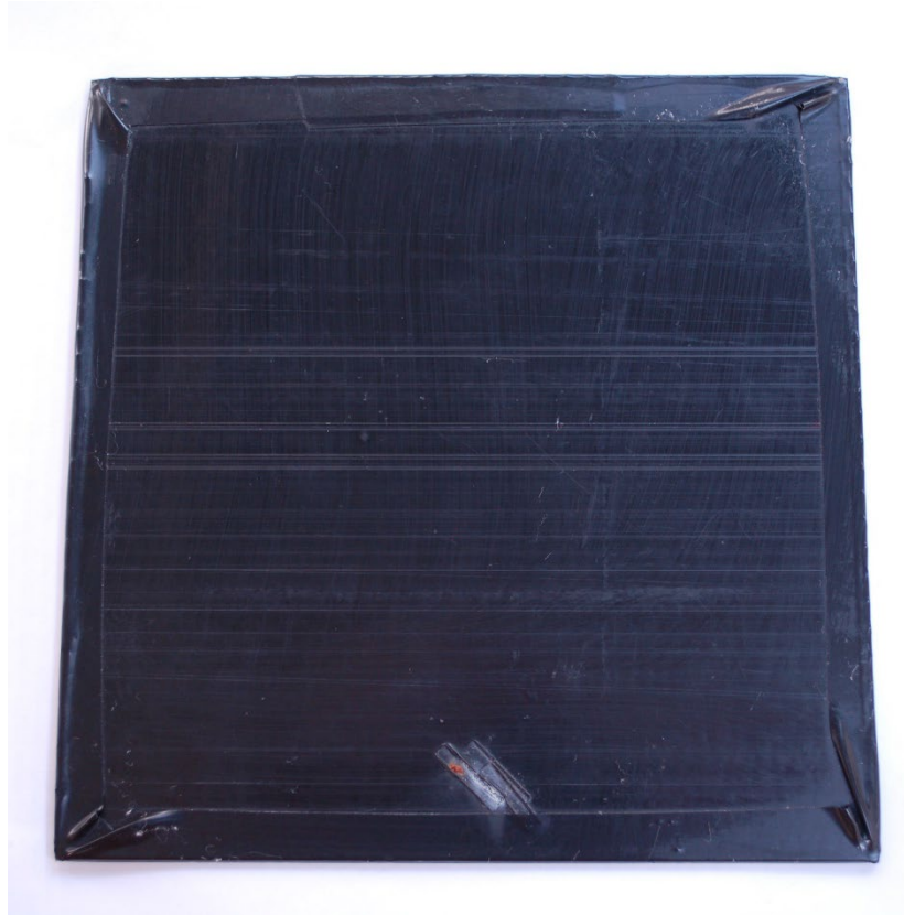
Sample 11B, 100 Cycles, Trenchcoat over galvanized