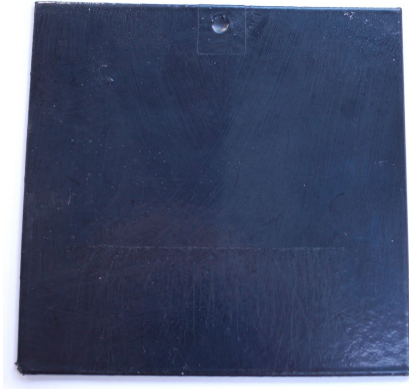
Sample 6A, 100 Cycles, Carboline 858 & Polyarmor G17