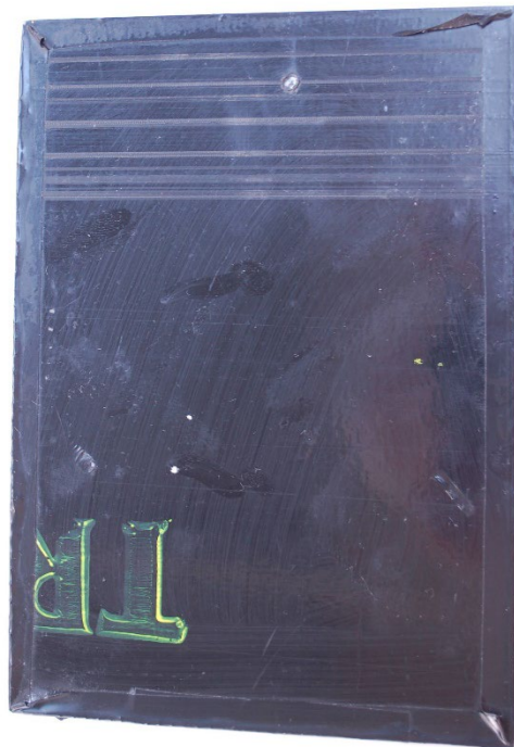
Sample 12B, 100 Cycles, Trenchcoat over galvanized