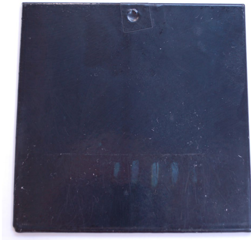
Sample 5B, 100 Cycles, Carboline 858 & Polyarmor G17