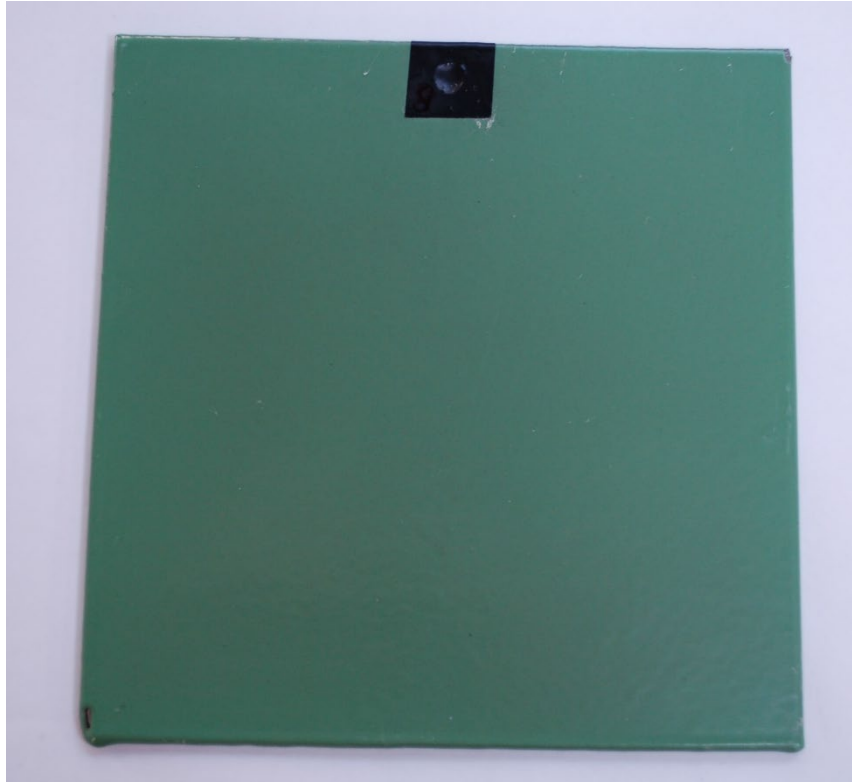
Sample 8B, 100 Cycles, Carbolite 858 & Pipe Clad 2000 Epoxy